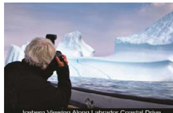
Iceberg Viewing Along Labrador Coastal Drive