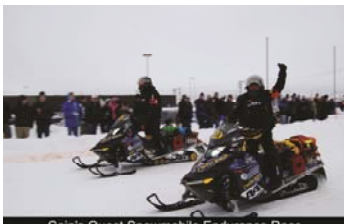
Cain's Quest Snowmobile Endurance Race