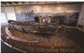
Red Bay Basque Whaling Station UNESCO World Heritage Site