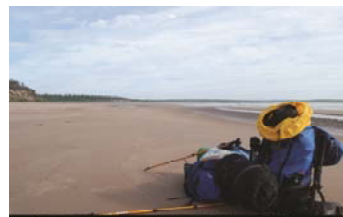
Wunderstrands, Mealy Mountains National Park Reserve