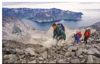
Torngat Mountains National Park