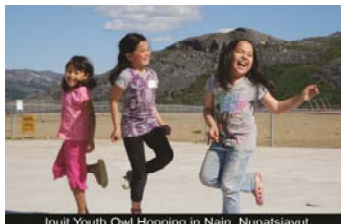
Inuit Youth Owl Hopping in Nain, Nunatsiavut