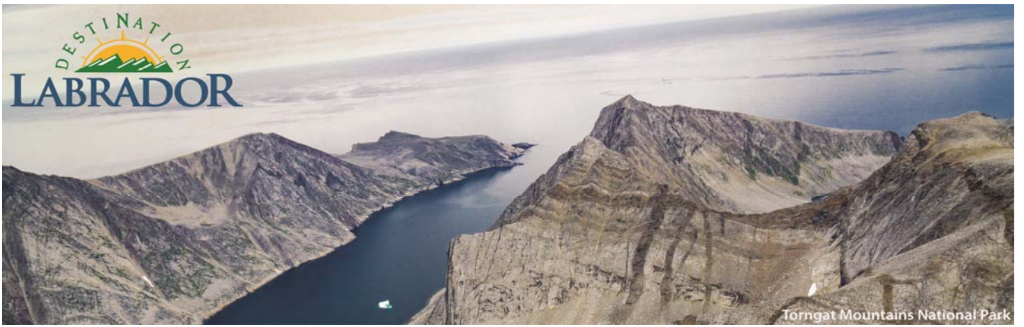
Torngat Mountains National Park

On the northeast coast of Canada, Labrador offers a different kind of tourism experience. Untouched beauty and vast wilderness are the backdrops for scenic communities, aboriginal cultures and diverse wildlife. Unique coastal touring routes, world-class fishing, adventure cruising and snowmobiling speaks to the explorer in all of us.