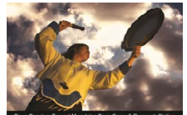
Drum Dancing, Torngat Mountains Base Camp & Research Station