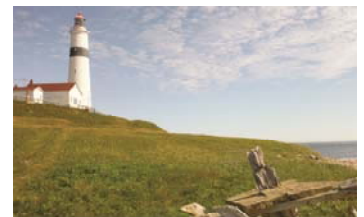
Point Amour Lighthouse, Atlantic Canada's Tallest