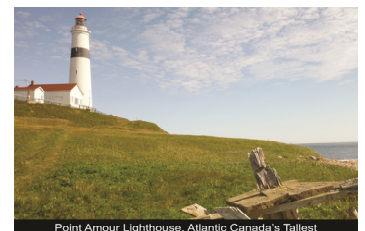
Point Amour Lighthouse, Atlantic Canada's Tallest