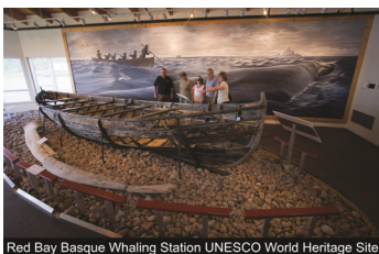
Red Bay Basque Whaling Station UNESCO World Heritage Site