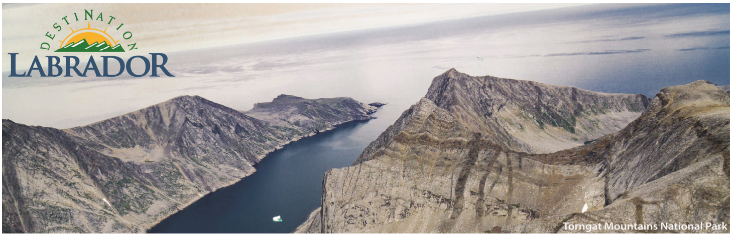
Torngat Mountains National Park

We Can Help. Through regional marketing, destination and market readiness initiatives Destination Labrador supports key travel trade activities such as fam tours, sales calls and marketplace attendance to educate and facilitate the sale of Labrador travel experiences. On the northeast coast of Canada, Labrador offers a different kind of tourism experience. Untouched beauty and vast wilderness are the backdrops for scenic communities, aboriginal cultures and diverse wildlife. Unique coastal touring routes, world-class fishing, adventure cruising and snowmobiling speaks to the explorer in all of us.