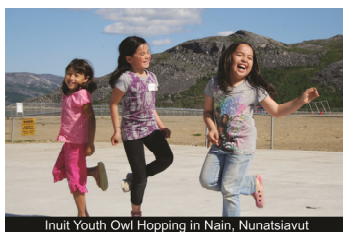
Inuit Youth Owl Hopping in Nain, Nunatsiavut