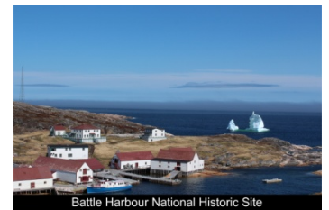
Battle Harbour National Historic Site