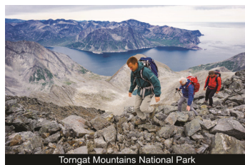
Torngat Mountains National Park