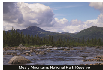
Mealy Mountains National Park Reserve