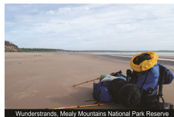
Wunderstrands, Mealy Mountains National Park Reserve