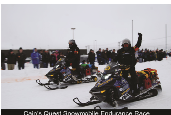
Cain's Quest Snowmobile Endurance Race